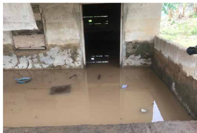
Fig 4. House for sale due to flood-related problems

Some of the tenants shared the following comments: