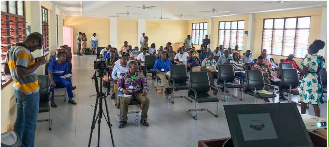
Fig 3. District workshop to validate the study findings

On completion of the data collection and the initial data analysis, there was a validation workshop on 28 June 2022 that brought together a section of stakeholders that provided data for the study. This included also community members from the seven selected communities, their assembly members and unit committee members, municipal and district chief executives, local government engineers, planning officers and representatives from the land sector agencies, as well as other the key stakeholders mentioned above.