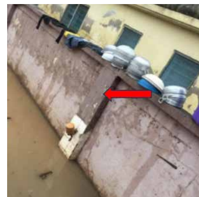
Fig 1. Level of flood water marked on the walls of houses