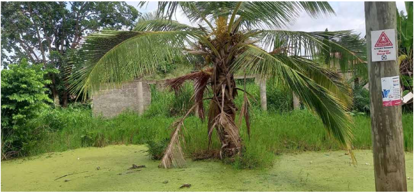
Fig 6. Uncompleted abandoned house at Deduako in stagnant flood water, near KNUST